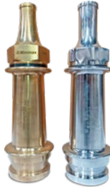
Couplings & Nozzles