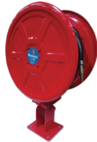
Hose Reel Drum